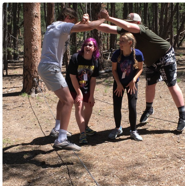
Ropes Course at La Foret